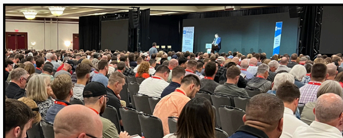
9MARKS AT 9, SBC ANNUAL MEETING