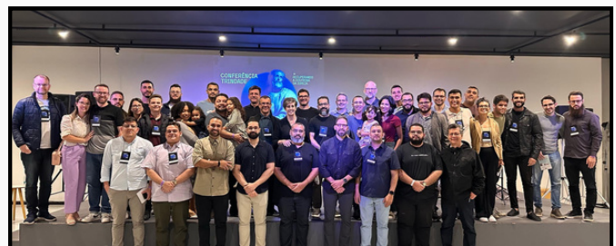
PASTORS CONFERENCE IN BRAZIL