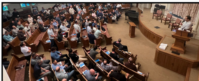
WEEKENDER, CAPITOL HILL BAPTIST CHURCH